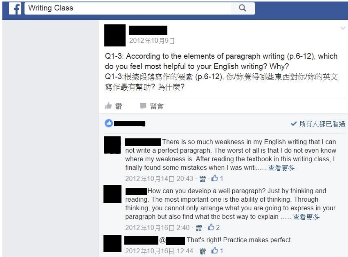
Figure 1. Snapshot of class page on Facebook.

the final grade. Aside from functioning as a platform for writing assignments, the class Facebook page was an interactive environment for both instructor-student and student-to-student communication.