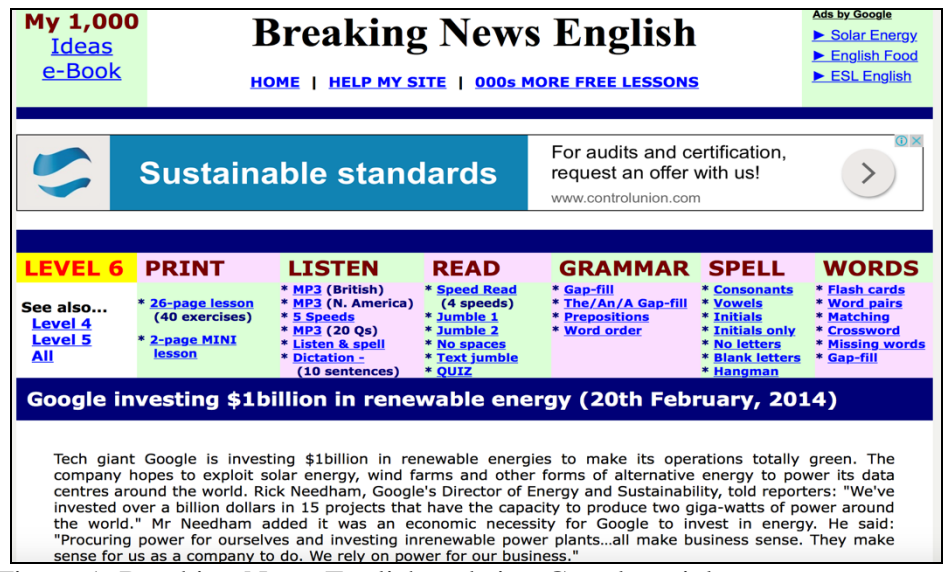
Figure 1. Breaking News English website: Google article

http://www.breakingnewsenglish.com/1402/140220-renewable-energy.html http://www.breakingnewsenglish.com/1401/140103-candy-crush-saga.html http://www.breakingnewsenglish.com/1308/130826-volunteering.html http://www.breakingnewsenglish.com/1312/131226-fairy-tale-wedding.html