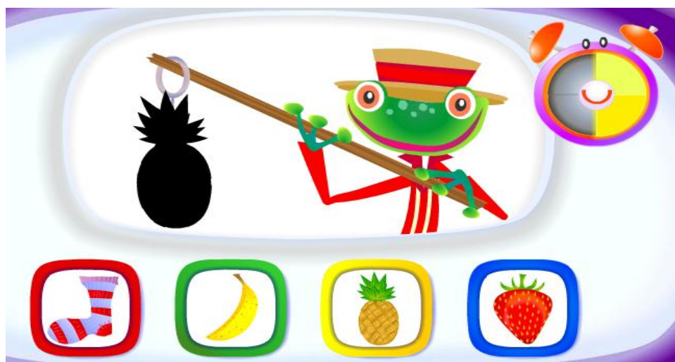
Figure 3. An activity in Play Games.

visual imagery and symbols with listening comprehension aids in young learners computer skills, cognitive development and meaning making (Bullar, 2009; Tall, 2000). CBeebies provides children with basic but not very challenging learning opportunities in this way.