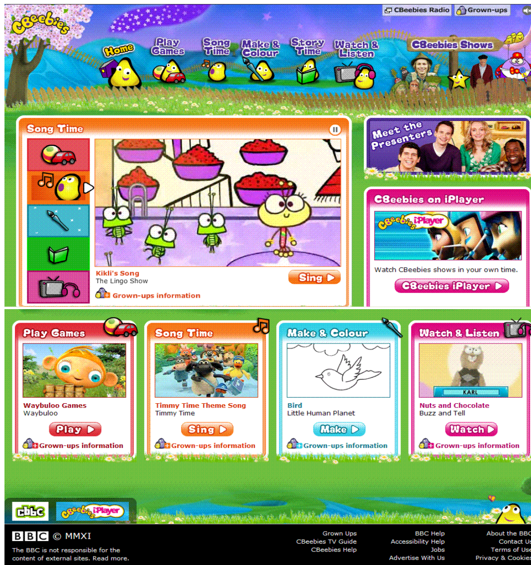
Figure 1. CBeebies homepage.

In each of the five sections, the content is categorized in four ways: Our Picks, Show, Theme and alphabetical order. Users can select the content from these different choices (see Figure 2 for an example). In each category sorted by theme, there are different topics. Learners who do not read yet may require adult instruction to explain the topics.