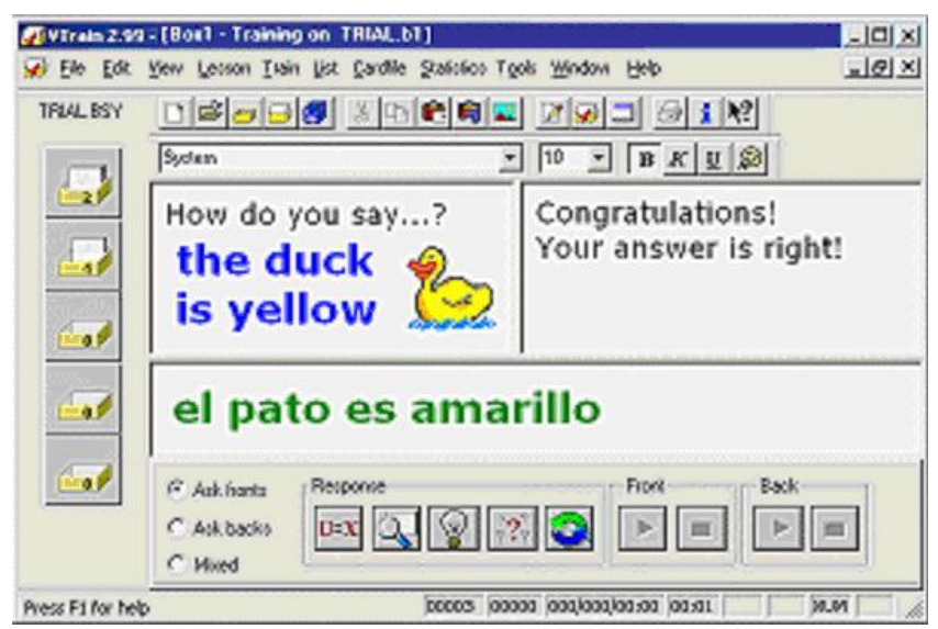
Figure 6. Training on box 1 of a 5-box cardfile in VTrain's Training mode

In a typical routine, users would first create or open one or more lessons of cards, and then add them to the first box of a cardfile for study. As the user then performs sessions in Training mode the cards in the file are promoted or demoted to higher or lower boxes. The user must manually open and close the various files: what is called an "automatic scheduling function" is just an ability to link cardfiles together, allowing cards to be promoted or demoted among them, according to an elaborate scheme as explained in the documentation.