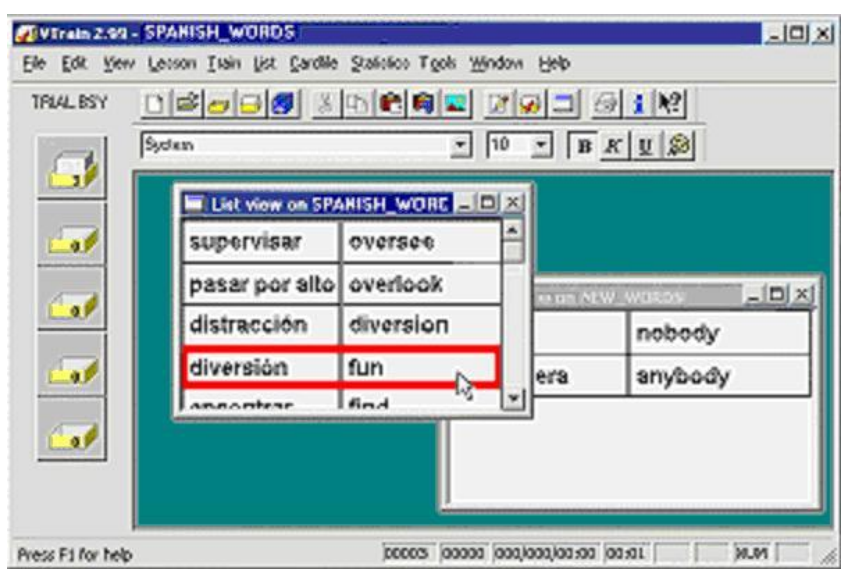
Figure 5. VTrain's List views mode, showing two open lists

The default interface provides access to VTrain's numerous features and functions via a complex array of controls (menus, toolbars, etc.), although it can be simplified. Interaction with VTrain takes place in one of four "function modes": Lesson Edition mode, List views, Training mode, or Flashing mode. In Lesson Edition mode the cards in a lesson file can be edited, with a selection of text formatting tools available. In List mode (Figure 5) the cards in a lesson can be browsed easily, and as VTrain does allow multiple lists to be open at the same time, drag and drop between them are supported. In Training mode (Figure 6) the program prompts the user to type the contents of the opposite side of cards as they are displayed, and is performed on one box of a cardfile at a time. Flashing mode is considered a presentation-only variant of Training mode and displays the cards of a lesson or a box sequentially.