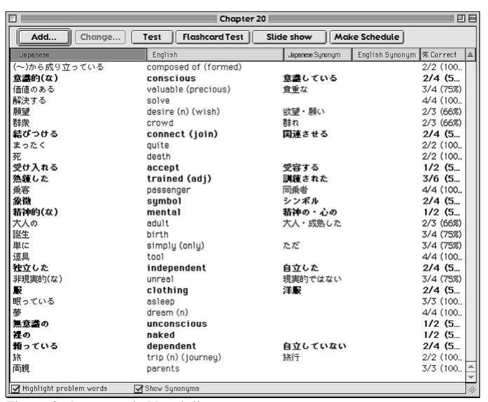
Figure 3. An example Vocab list

over about 16 weeks, selectively favoring problem words, such that not all words from each list are tested each time. Tests can be set to pop up automatically on designated days, or even as a screen saver, and a helper application, Am I Scheduled? allows the user to easily check for waiting tests.